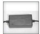
Power Supply (located at one end of the rail)