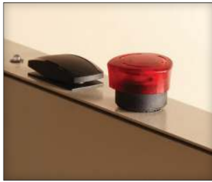
LED Indicator Light, E-stop and Up/Down Control Switch

Safety Features Overspeed Governor Under Platform Safety Pan Obstruction Sensors Upper and Lower Landing Limits Drive Chassis Obstruction Sensors Upper and Lower Final Limit Non-skid Surface Ramp Obstruction Sensors