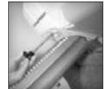
Manual Hand Crank