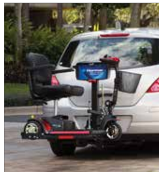
Multiple auto lift solutions for chair or scooter