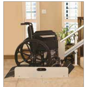
Incline Platform Lifts