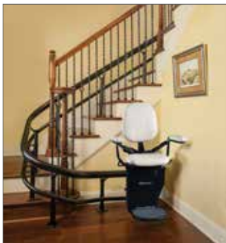
Curved and Straight Stair Lifts