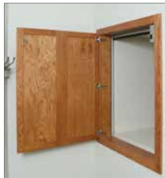
Dumbwaiters and Cargo Lifts